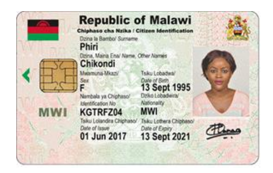
Figure 1. Approved National ID Card Design Front

The design of the card (shown in Figure 1, below) was approved by the Minister of Homeland Security to meet the three tier requirements. These are security features which are visible to the naked eye; enhanced security features that require minimal equipment to verify identity; and forensic analysis features that require high end equipment such as a microscope to verify identity. Security requirements of the International Civil Aviation Organization (ICAO) and the information requirements elaborated in Section 8 of the law are also met. Additionally, the card allows for data to be manually read, or for machine reading using a QR code, swipe read, and chip read that will overcome traditional challenges with data accuracy. Overall, the design and features of the card draw on key technologies and processes that make forgery of the card improbable and enables mechanisms to verify its authenticity to ensure confidence that the card, as required by law, is prima facie evidence of the individual's recorded information.