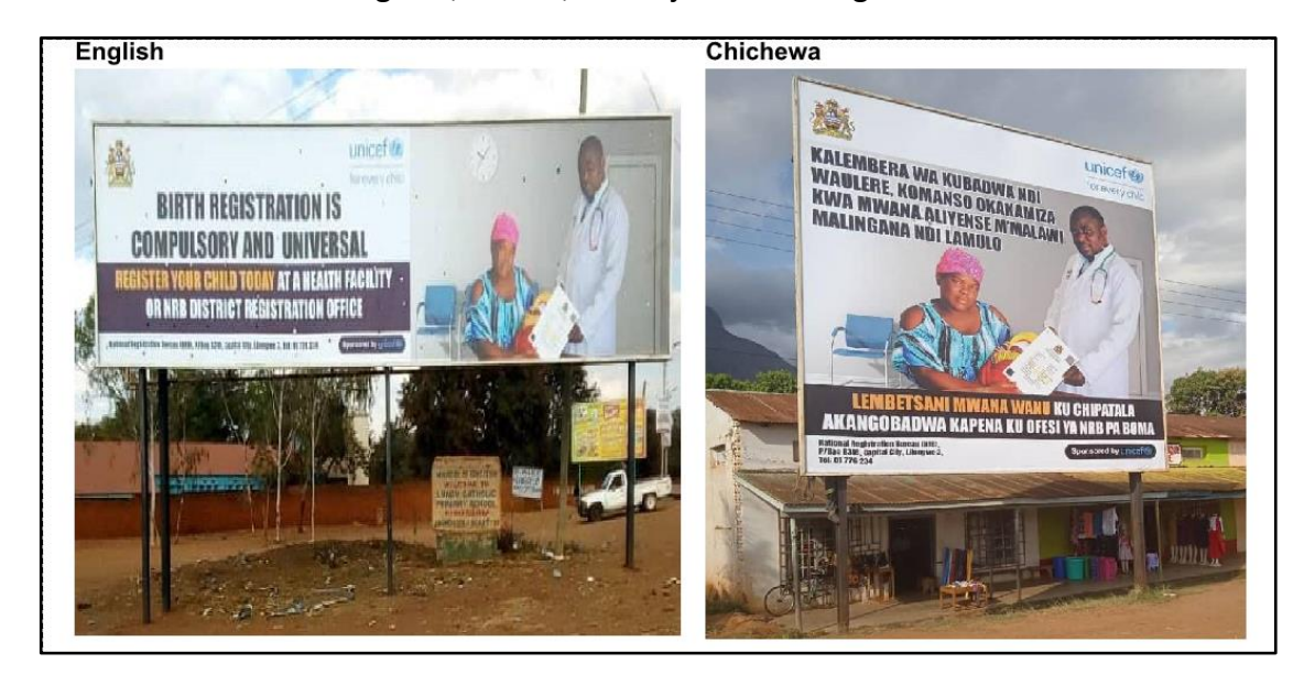
Pic: Example of Civic Education billboards

However, the activities were largely focused on the demand side of registration services. There is a need to train service providers from the health facilities, district registration offices and post offices, and traditional leaders (also designated as local registrars). This approach will ensure prompt, better identification and registration systems for births that are happening in the community as well as in the health facilities.